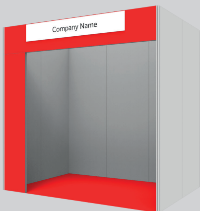
2 lati aperti 2 sides open